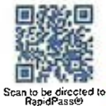
Scan to be directed to RapidPass®

For more information or to schedule an appointment, please call 1-800-RED CROSS (1-800-733-2767) or visit www.redcrossblood.org and use sponsor code: LivingWater